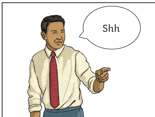
"Quiet class!" exclaimed the teacher.

Extension: Alter the sentences used to describe the pictures, with commas to clarify meaning where needed: